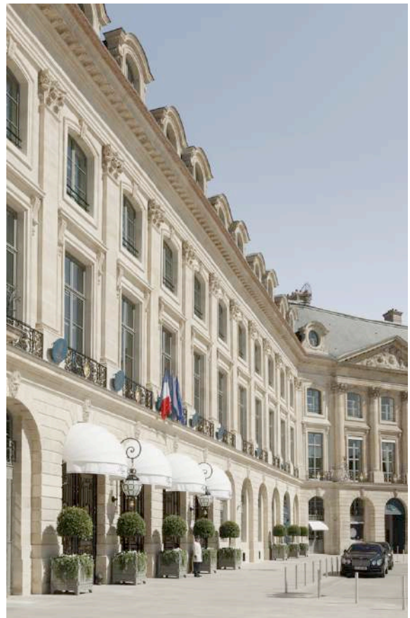
▲ The Ritz.

Opened in 1898 by César Ritz, this French luxury hotel has remained the epitome of elegant French style and was once